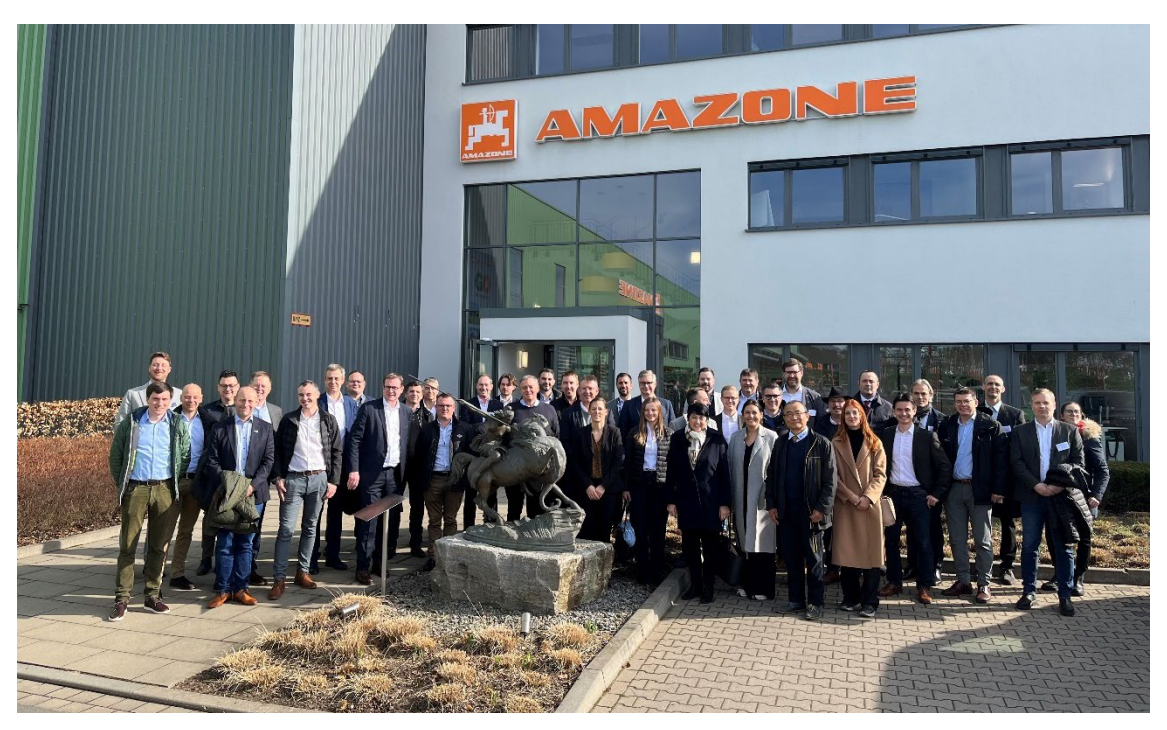
Members of the CEMA European Product Groups meeting in Hasbergen at Amazonen-Werke H. Dreyer