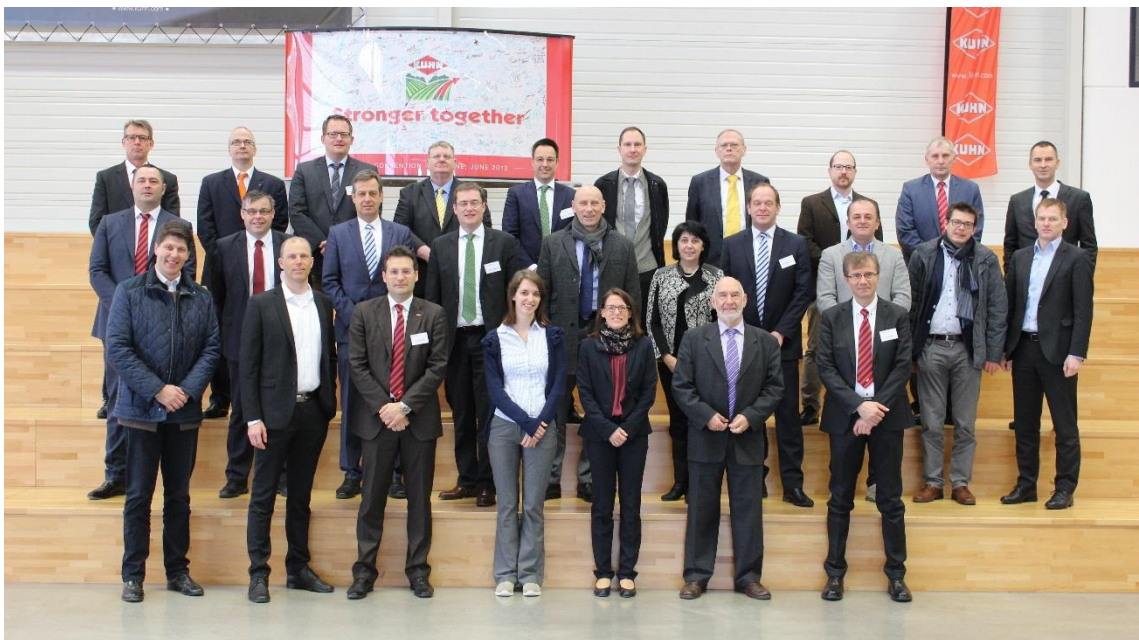
Participants of the 2017 CEMA Product Group meeting at Kuhn in Saverne (France)