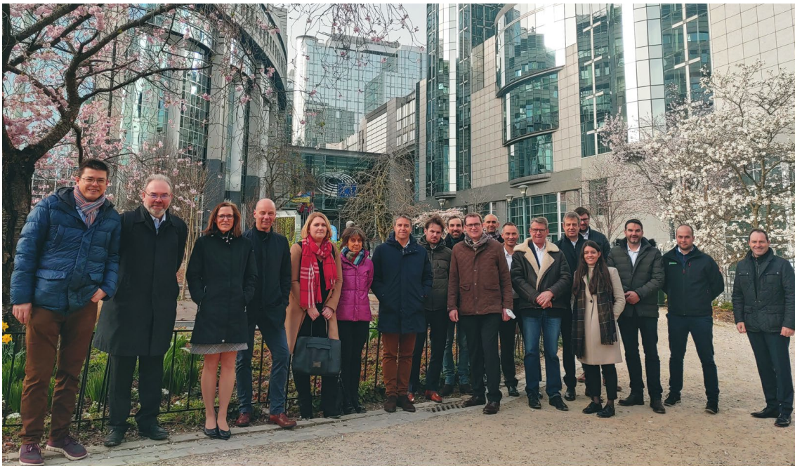
Members of the CEMA Product Groups "Arable Farming" in Brussels at the European Parliament