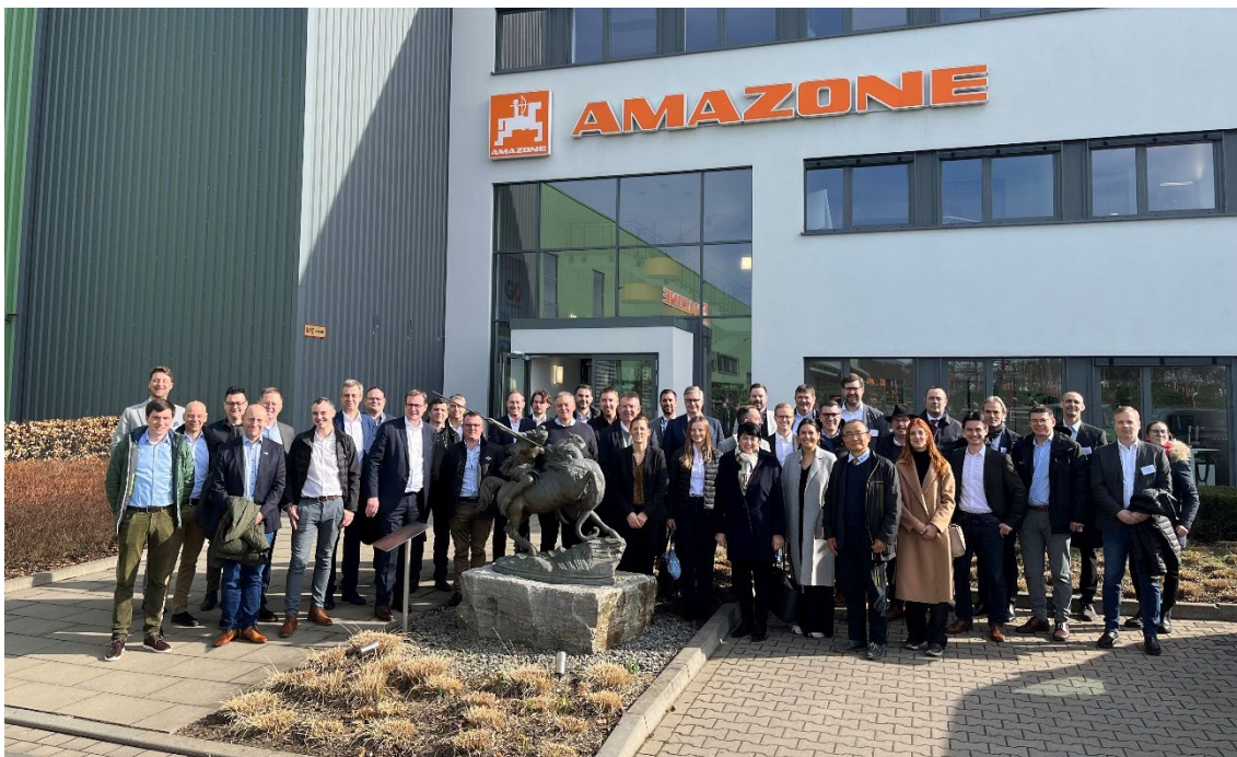
Members of the CEMA European Product Groups meeting in Hasbergen at Amazonen-Werke H. Dreyer