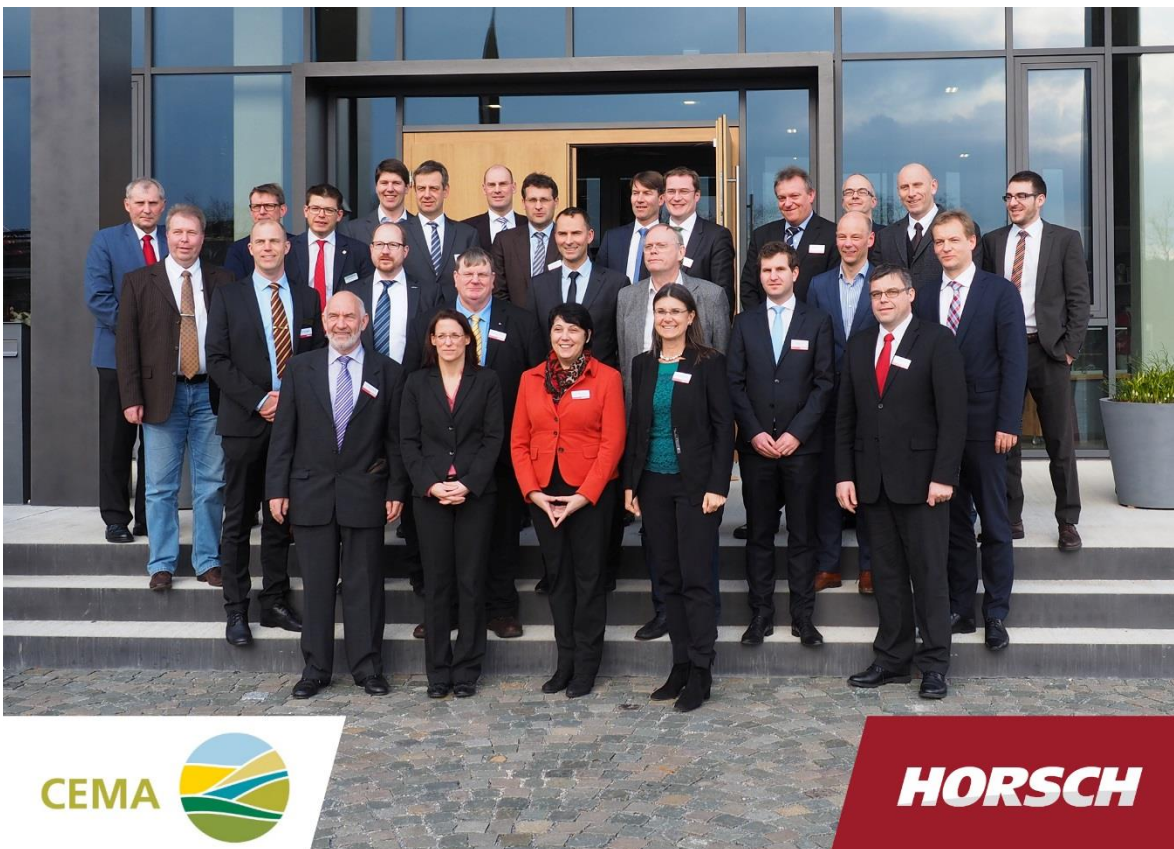
Participants of the 2016 CEMA Product Group meeting on 8 & 9 March at Horsch in Schwandorf